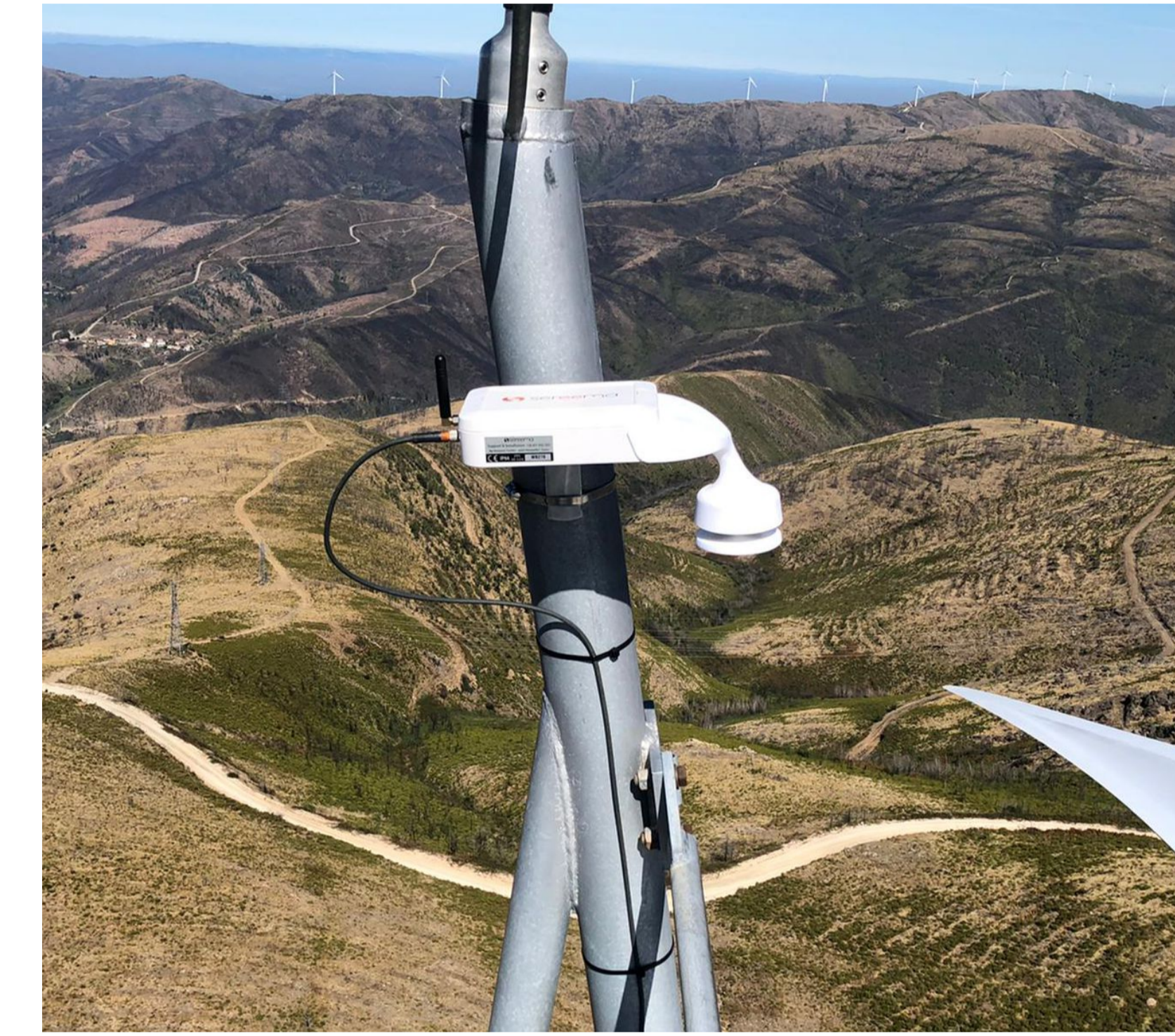
Figure 1 - Windfit box installed on a Vestas V90-3.0MW wind turbine. The box is attached mechanically to the anemometer mast on top of the nacelle.

An IoT sensing device is installed on the wind turbines with multiple embedded sensors such as accelerometers, anemometer and magnetic compass. This device has its own computing capacities allowing it to perform a part of the data analysis on-site, reducing the quantity of data to be transmitted, at the same time that it has data transmission capacities (through the GSM, 3G or LTE networks) to communicate the acquired and pre-processed data to a cloud server. Cloud servers are used to store the data sent from the sensing devices. Specially developed data analysis algorithms are applied to identify underperformance, defaults and non-optimal parameters on the equipped wind turbines.